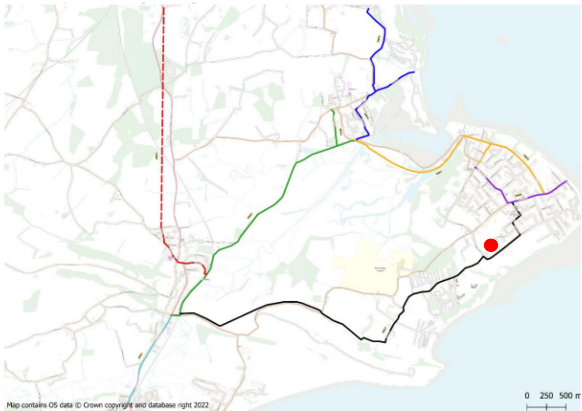
Figure 23 - Proposed Cycle Network

7.138 As can be seen, the LCWIP proposes walking and cycling improvements within the area close to the site, with the walking routes aimed at linking Steyne Road to Howgate Road (shown in blue and grey on the above plan). However, this route would still require pedestrians to walk along a 400m section of Hillway Road, to